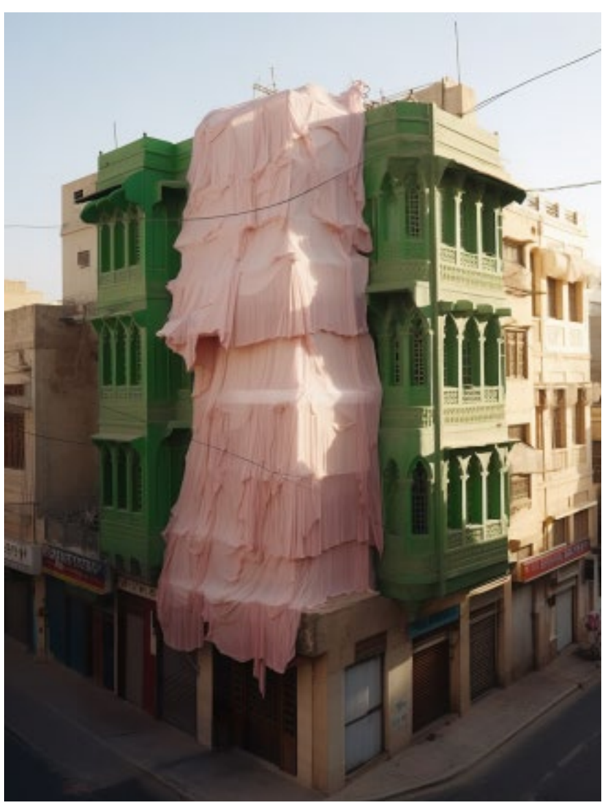
Andres Reisinger's "Takeover", 2023

In a collaboration with the cross-disciplinary art collection RFC and ATHR gallery's experimental and technological art initiative AKTHR, we are