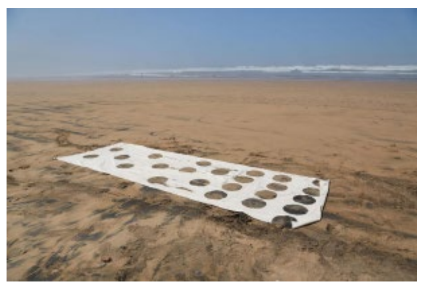
Ayman Daydban's "Black Eye", 2015.

This group exhibition invites contemporary arts enthusiasts to a deeper understanding of materiality and object significance. At the core of this exhibition are artists who have taken unique approaches in exploring the significance of objects —both commonpl ace and abstract —in our lives. The exhibition serves as a call to reimagine the world around us, invoking unexpected and stimulating discussions about what is often unseen or unconsidered. It is an invitation to redefine the boundaries of what we find aesthetically significant, beckoning us to find beauty and meaning in the most surprising of places.