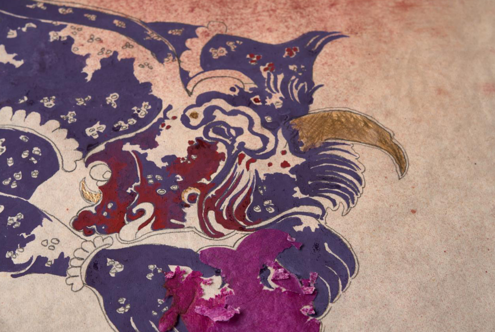
The Woman and the Devil , featured at Art Basel Paris, 2024

For Paris Plus 2024, Bahmim curated a collection featuring a blend of unique works and specially-commissioned pieces. This collection encourages audiences to engage with intimately human themes that transcend geographical and temporal boundaries.