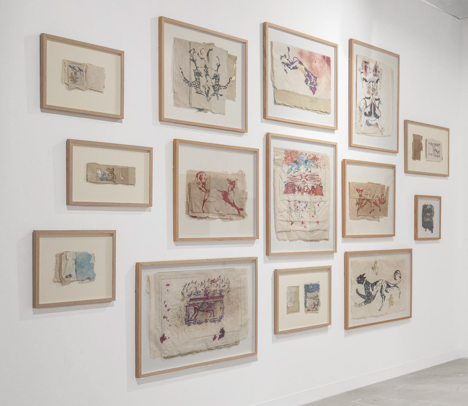
Installation of Bahmim's wall at Abu Dhabi Art, 2024

For Abu Dhabi Art, Bahmim's use of media and motifs is intentional and meditative, as she repurposes pre-existing elements in an attempt to retain their three-dimensional nature. The artist marries concepts and materials, ensuring that the experiences they reflect are not flattened – she retains their complexity.